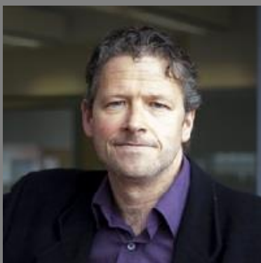
[NC name], [nationality] NC